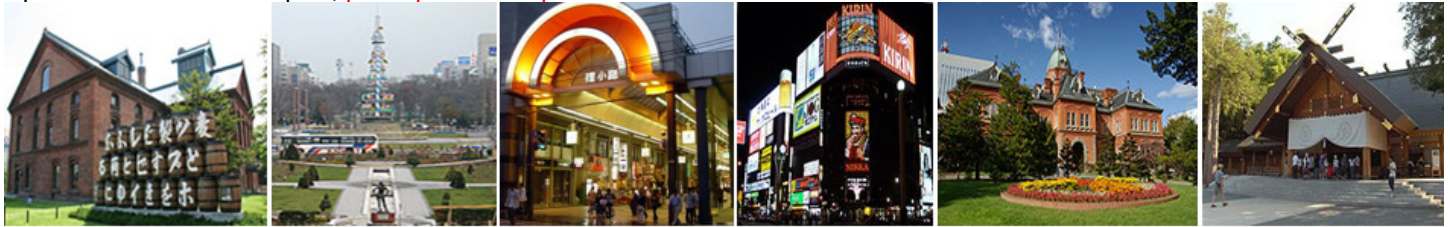
Sapporo Beer Museum

Upon arrival Chitose Airport, pick up car at airport area.