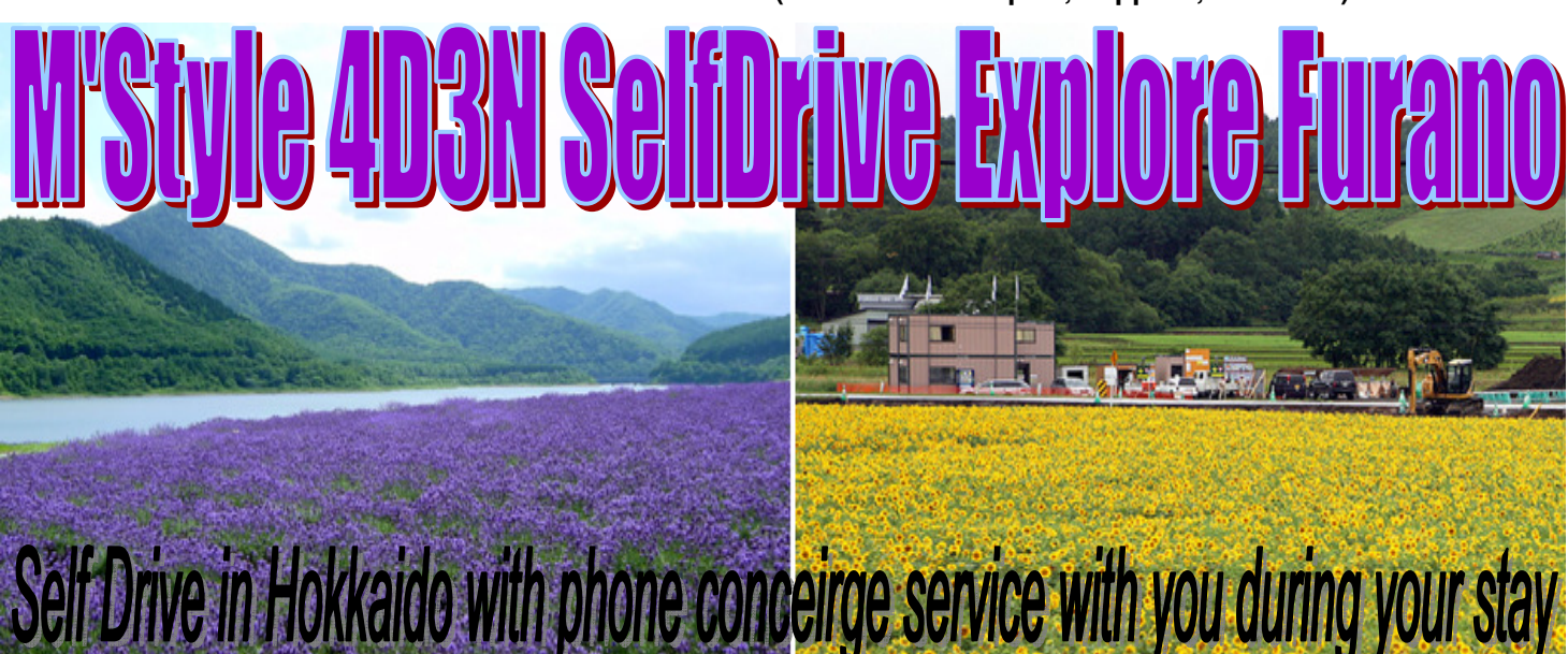
Day 1 Arrival Chitose - Sapporo