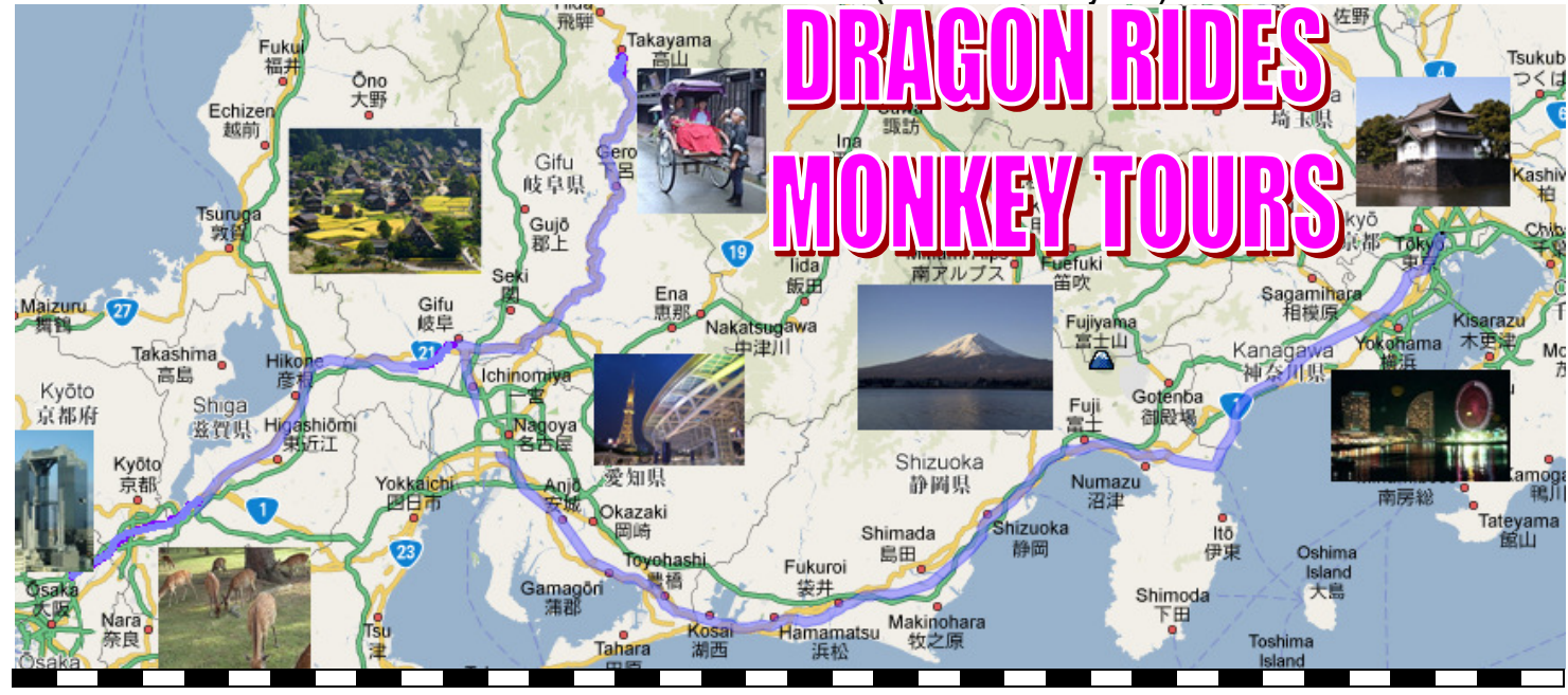
~Enjoy a 7 Days free rides of all JR trains including Shinkansen Bullet Train~ with Kikubari Travel Concierge Hotline with multilingual (English, Mandarin, Cantonese, Hokkien, Bahasa & B. Indonesia

Tour Code: DRMT.0.02 DROGON RIDES MONKEY TOURS 8D7N (Honshu + Takayama) In & Out Narita E1V3 0.08172